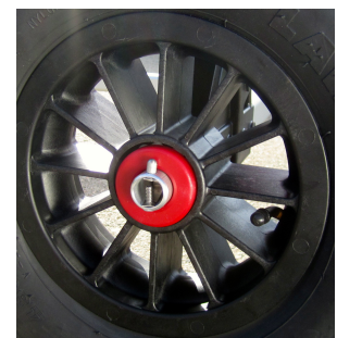
Snap Button Immobilized