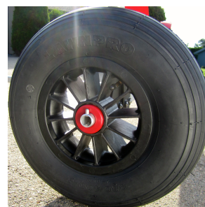
Unsecured Snap Button