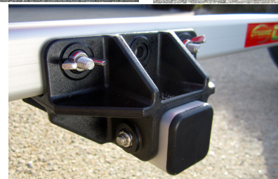
Wing Nuts for Quick Disconnect